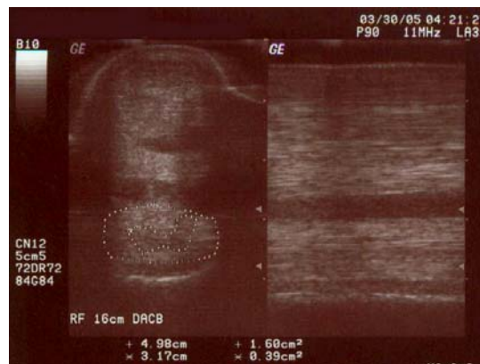
Figure 2: Suspensory Lesion, 16 cm DACB March, 30, 2005

On March 30, 2005 physical examination showed the horse to be increasingly improved, with only a 1/5 lameness in the right front limb noted when circling to the left. Ultrasound evaluation revealed generalized improvement in fiber pattern and echogenicity throughout the affected region (Fig 3). In the region 10 to 14 cm distal to the accessory carpal bone, short random linear echoes were still present with a slight increase in diameter still evident.